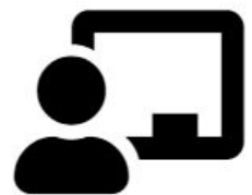
Open Educational Resources (OER)

VCU Libraries understands the importance of selecting the right course materials. Not only do zero textbook cost courses eliminate the cost burden for students, but they have been shown to improve student success while increasing instructor flexibility, including the ability to customize resources.